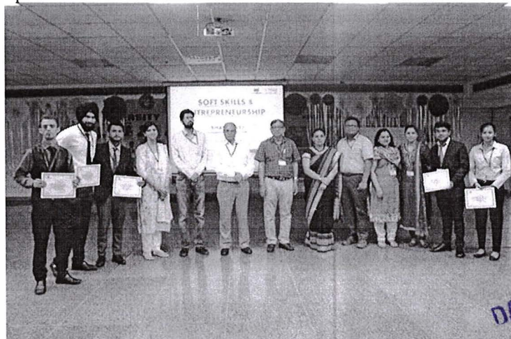
Felicitation ceremony of the experts of two day workshop on "Entrepreneurship and soft skills held on October 4-5, 2018