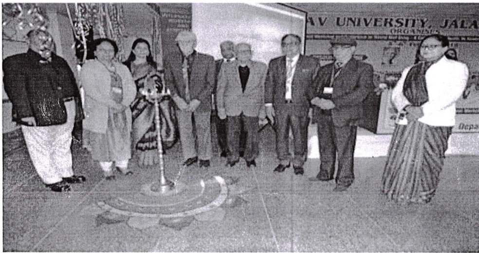
Inauguration and lamp lighting ceremony of the International Conference on Mental health