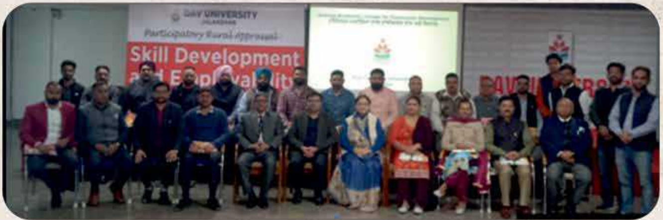
A seminar on Skill Development and Employability, organized for village Sarpanches on February 25, 2022.