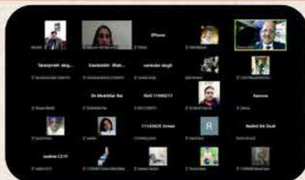
Webinar Series on "Evolving Technologies & Recent Trends in Computer Science 2022-Season 2"

Department of Computer Science and Applications, DAV University, Jalandhar organized a three day Webinar Series on "Evolving Technologies and Recent Trends in Computer Science 2022-Season 2" that commenced on 22-02-2021. Season 2 of the Webinar Series was inaugurated online by the Vice-Chancellor, DAV University. Eminent academicians and researchers from reputed institutions across the country enlightened the students with their vast knowledge and experience.