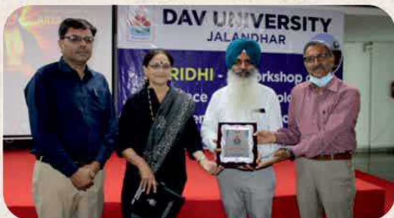
Workshop 'Smridhi' for the upliftment of SC/ST Community

DAV University, Jalandhar has been awarded a grant for setting up Science Technology & Innovation (STI) Cell for the empowerment of SC community by Punjab State Council for Science & Technology with the support of Department of Science & Technology, Govt. of India. The STI Cluster is to be established jointly by DAV University and NIT, Jalandhar. Under the aegis of this project, DAV University has adopted ten surrounding villages dominated by SC population namely Sarmastpur, Ballan, Kishangarh, Daulatpur, Alawalpur, Nussi, Kala Bakra, Kala Bahiya, Naugajja, and Karari . The experts from the university will impart job-oriented training to the residents of these villages. Also, the villagers will be given skill-based training for starting small scale industries.