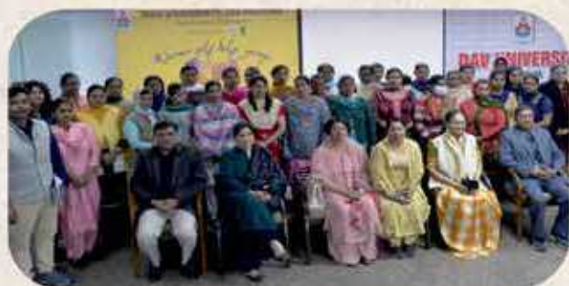
International Women's day Celebrations

14th September 2021: Envophilic- The Go Green Club of DAV University organized an event on " International Day for the Preservation of Ozone Layer " on September 14, 2021.