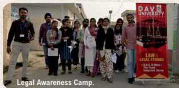
Legal Awareness Camp.

Science day was celebrated at DAV University on March 3, 2022 on the theme "Sustainable future". Students participated in different events like Sci-Rangoli, poster presentation, Quiz, Model and debate competitions.