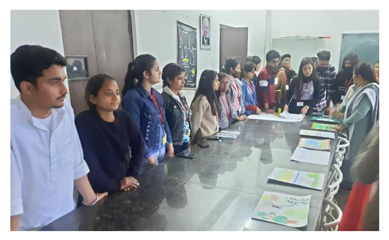
Poster making competition

Science fest was celebrated in the department on 3<sup>rd</sup> March, 2022. Students participated in different competitions like debate, flower arrangement, rangoli and poster making competition and video clip making competition - Agro vines.