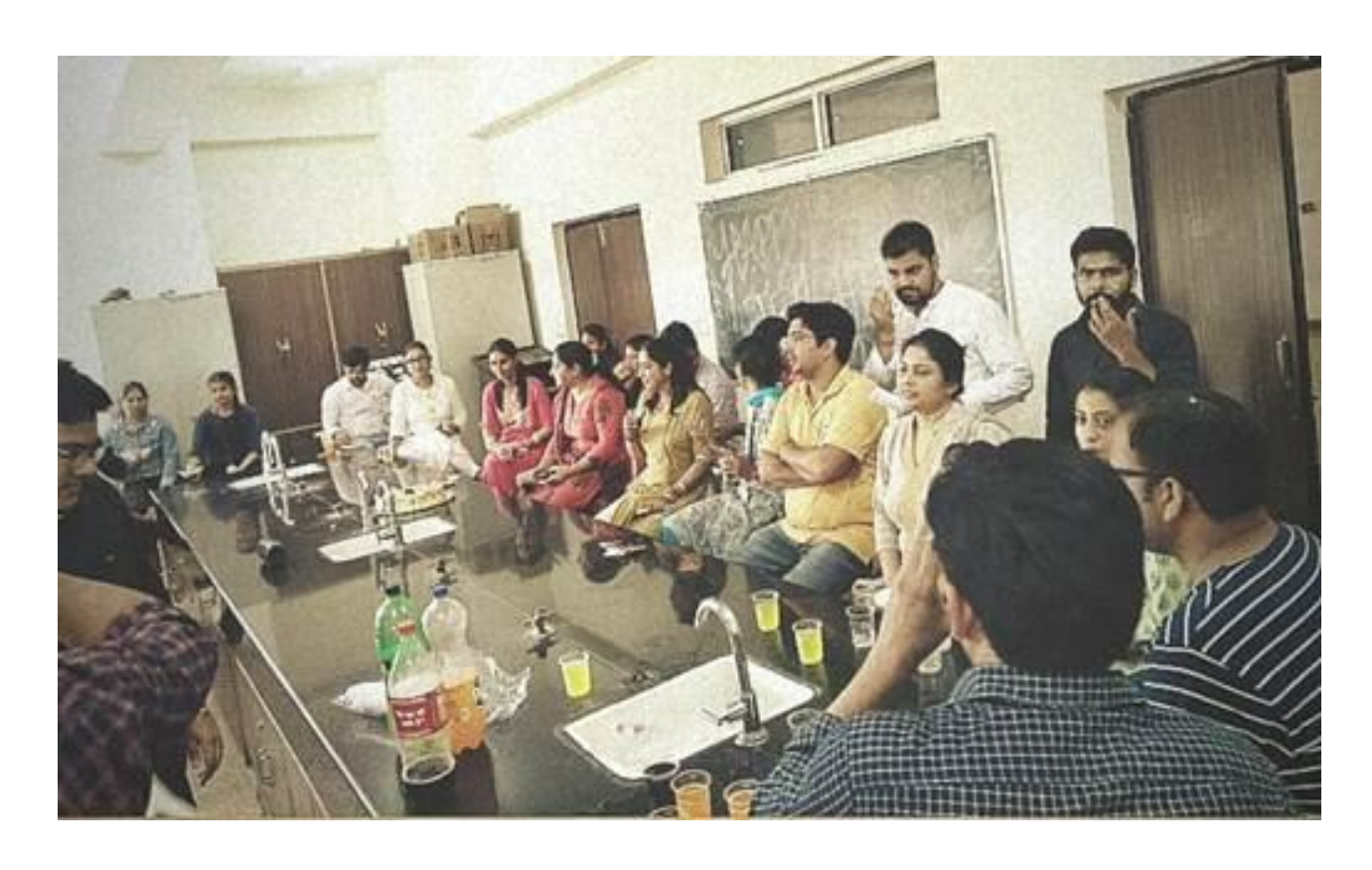
Teachers' Day \\ \text{Students celebrated teachers' day on 5}^{\text{th}} \text{ September, 2019 with great enthusiasm.}