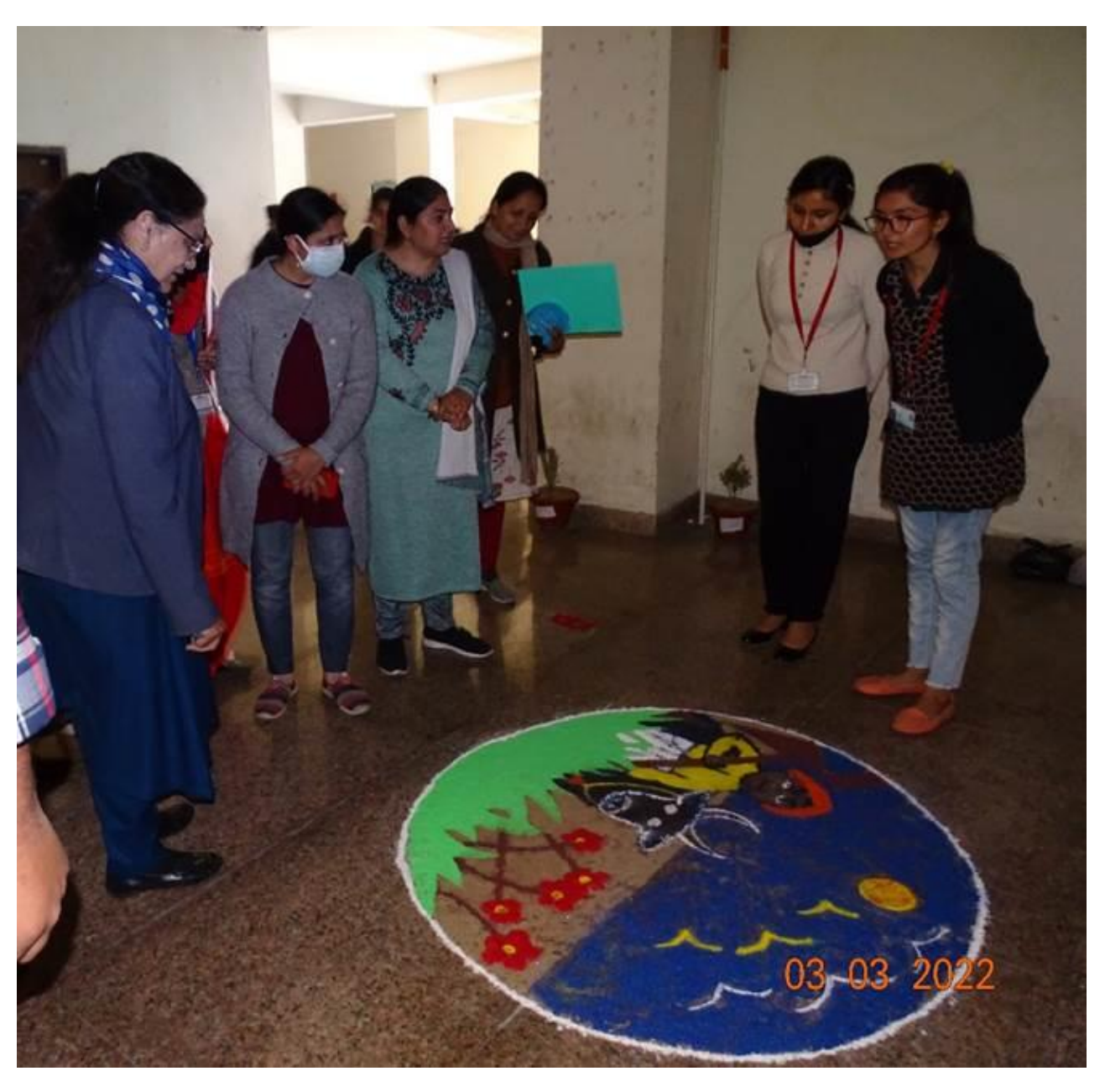
Rangoli making competition