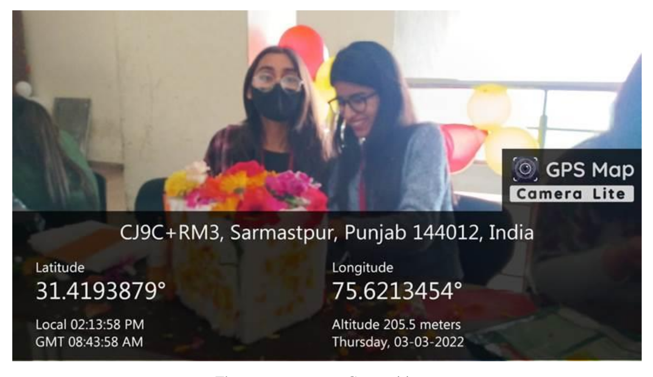
Flower arrangement Competition