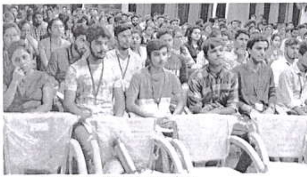
Students attending various sessions

There were three expert lectures on Day 2 of the induction programme. They enriched students on the topic of time management, entrepreneurship and life skills. The Induction program was well-organized, offering a comprehensive introduction to the university environment and encouraging active participation in both academic and extracurricular activities.