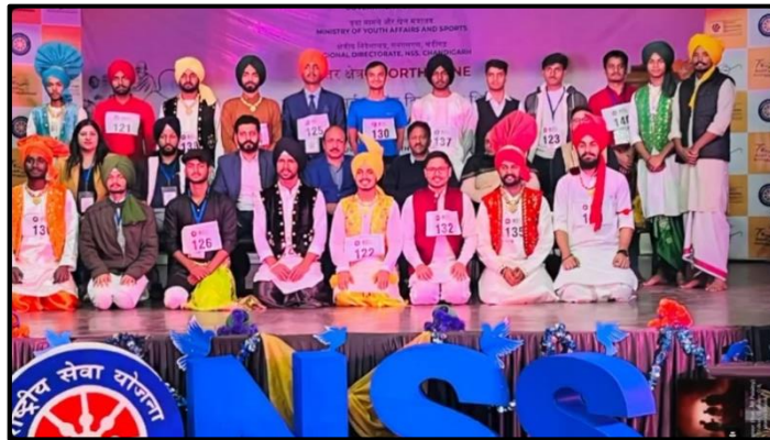
NIC Camp 2022