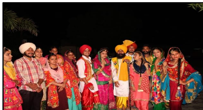
Pre Rd Camp 2021