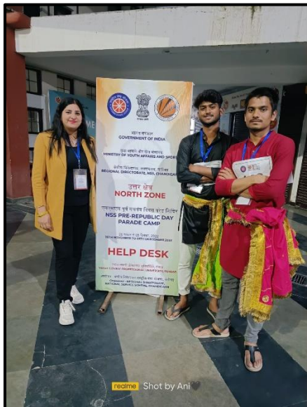
Pre Rd Camp 2022