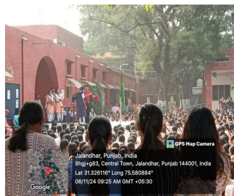
Conducting Morning Assembly