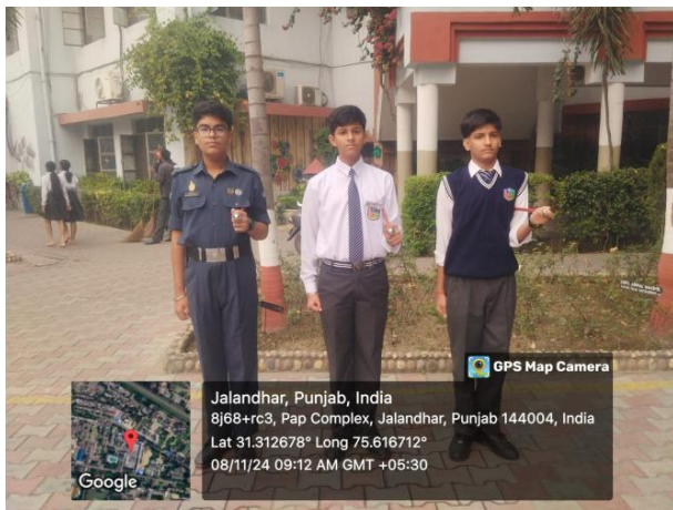
Participation in NCC