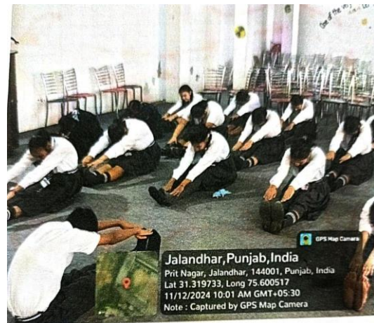
Yoga and Meditation