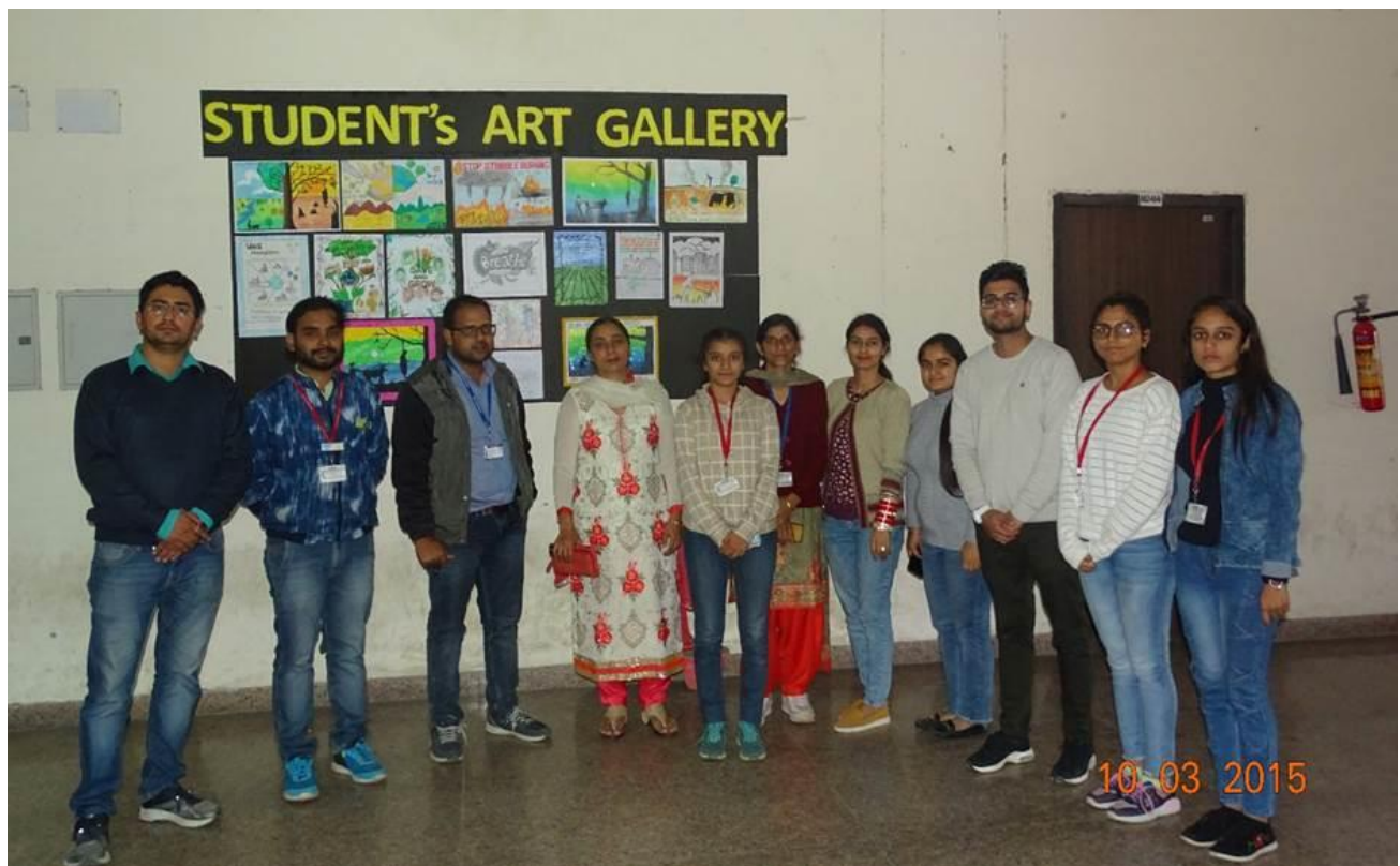
Agro vines- video clip making competition