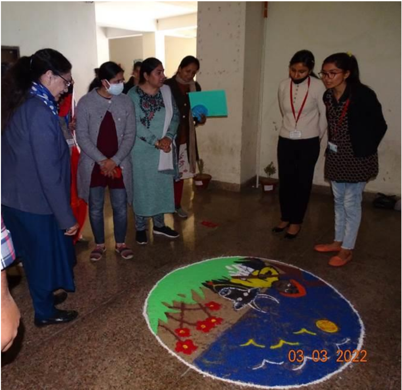
Rangoli making competition