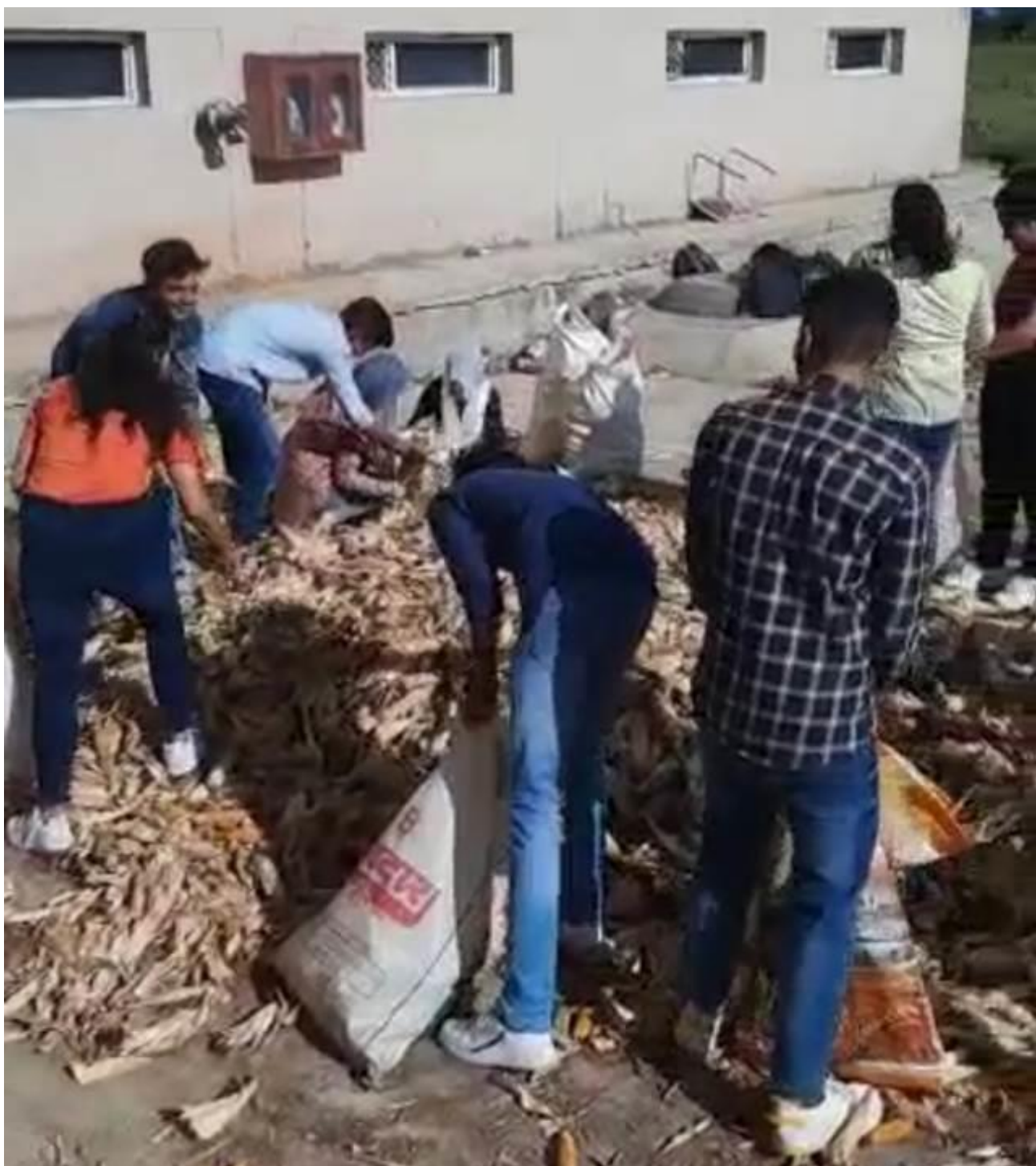
Science fest was celebrated in the department on 3 rd March, 2022. Students participated in different competitions like debate, flower arrangement, rangoli and poster making competition and video clip making competition - Agro vines.