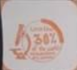
ROSA LIND FRANKLIN