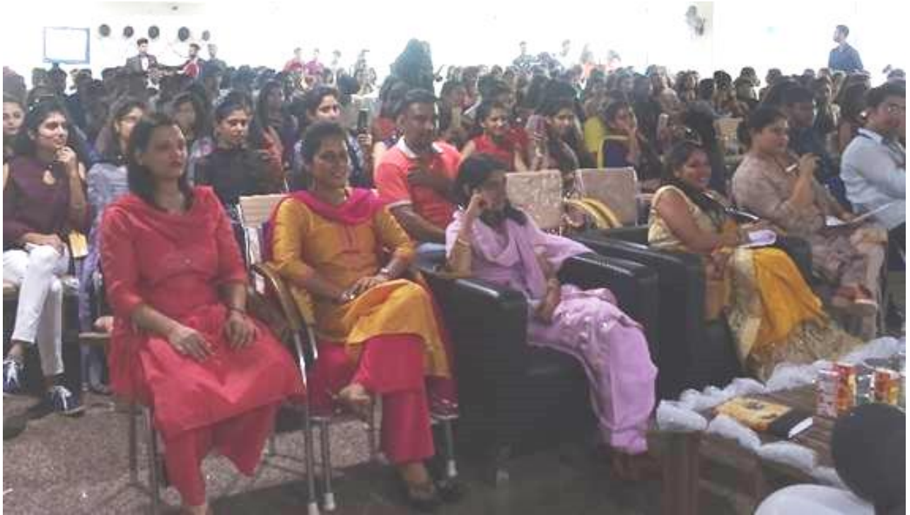
Agri Fest was organized by Agro club on 8 th Feb., 2019 in which students of various departments participated in different competitions like extempore, Agri quiz, PUBG and Chess