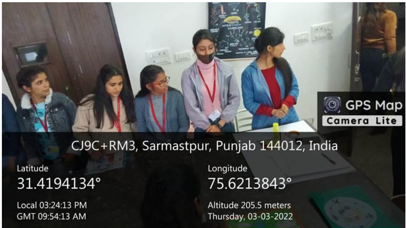
Poster making competition