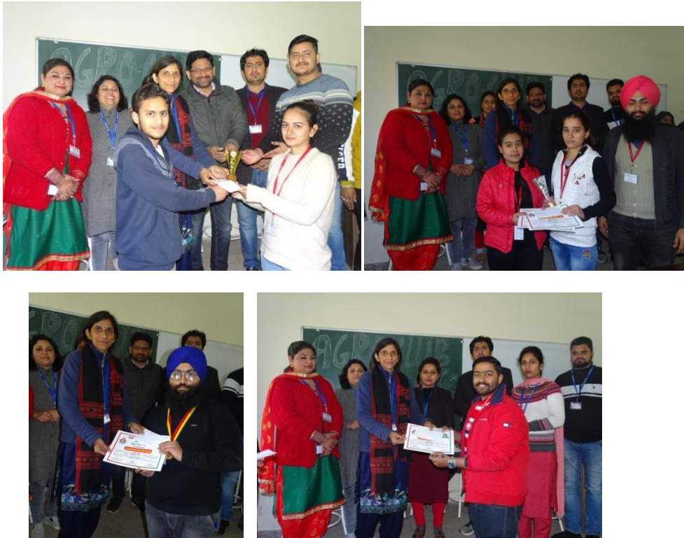
Prizes were distributed to the winners.