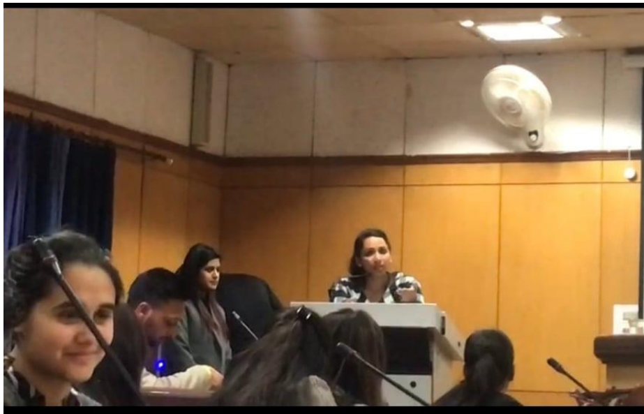
At Panjab University, Chandigarh