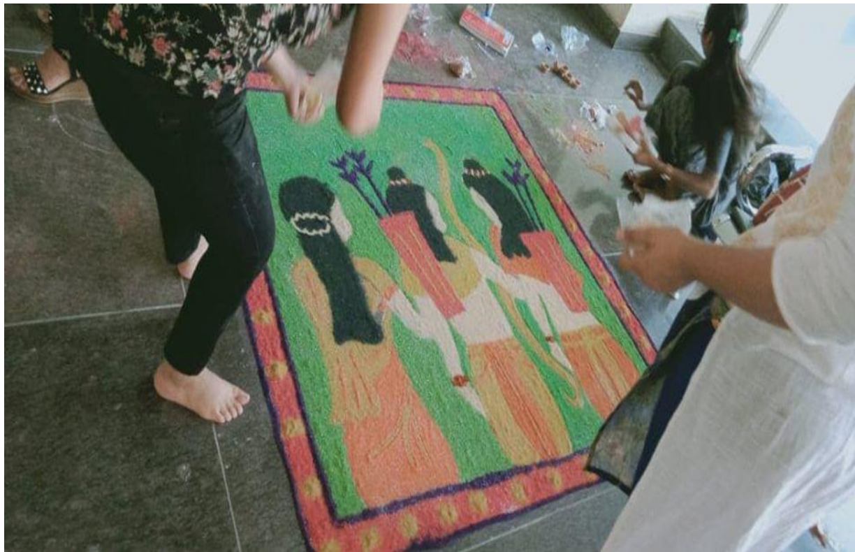
Diwali Mela, 2019