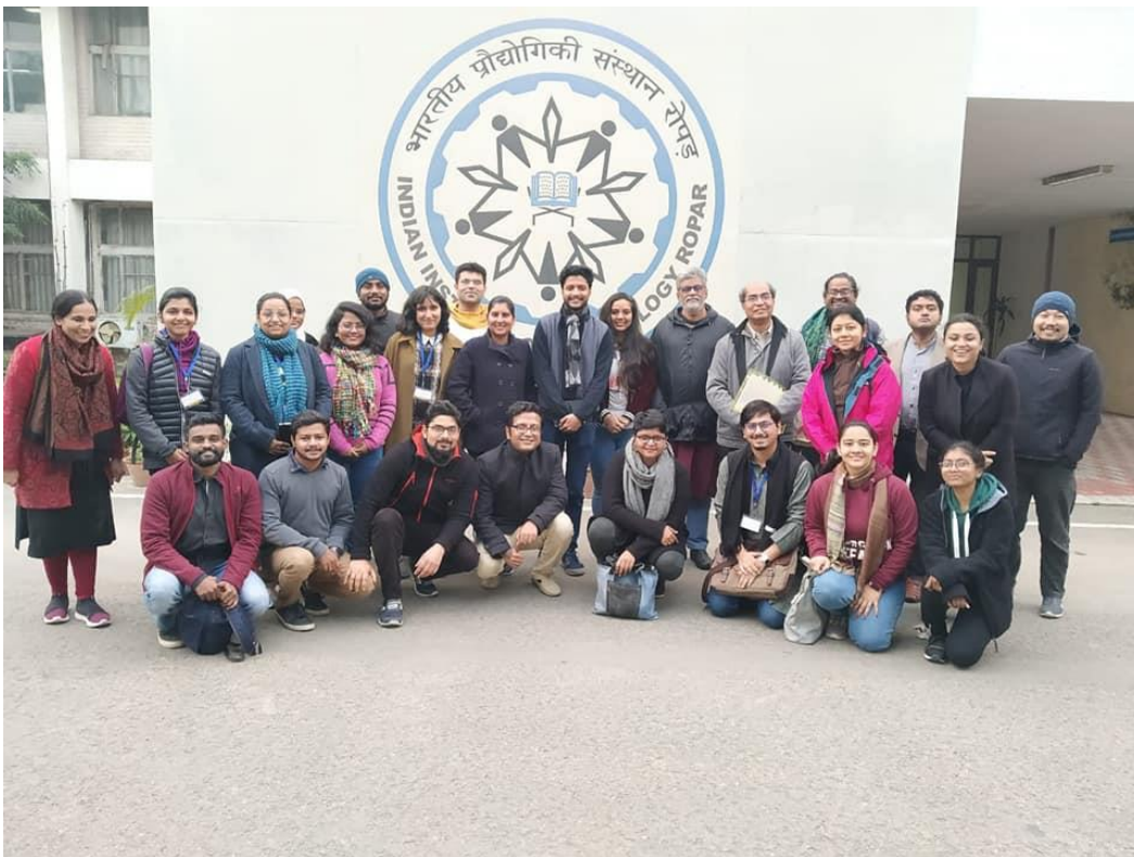
Indian Institute of Technology, Ropar