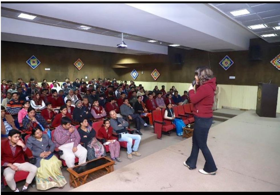
DAV School, Faridabad