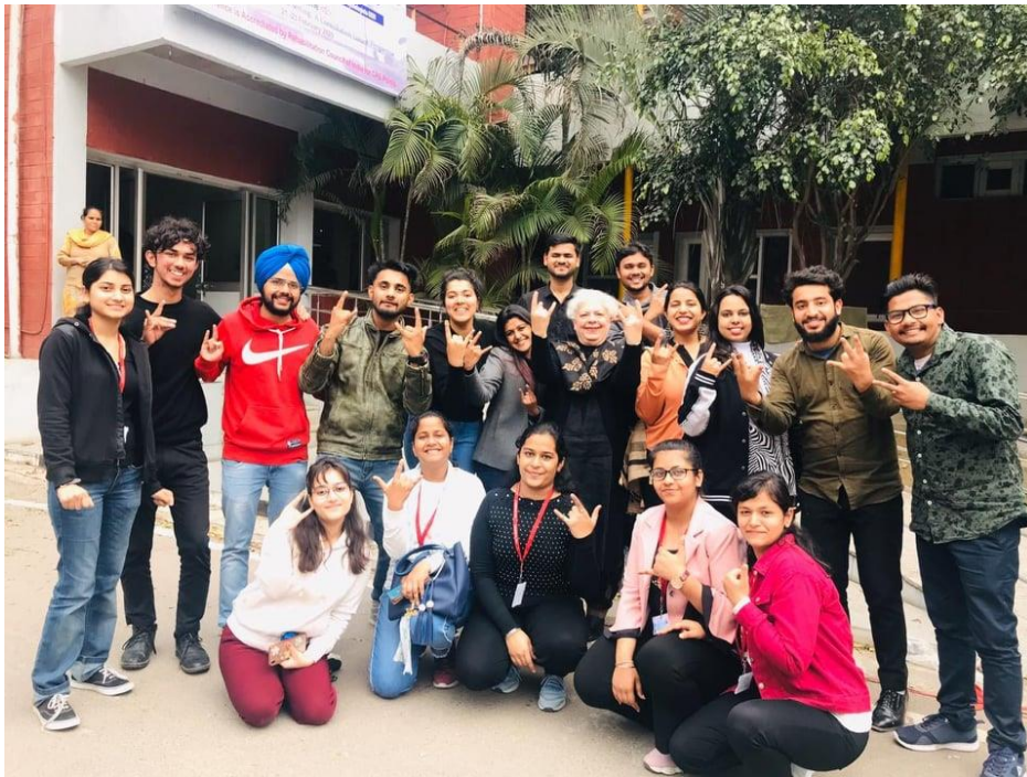
At Panjab University, Chandigarh