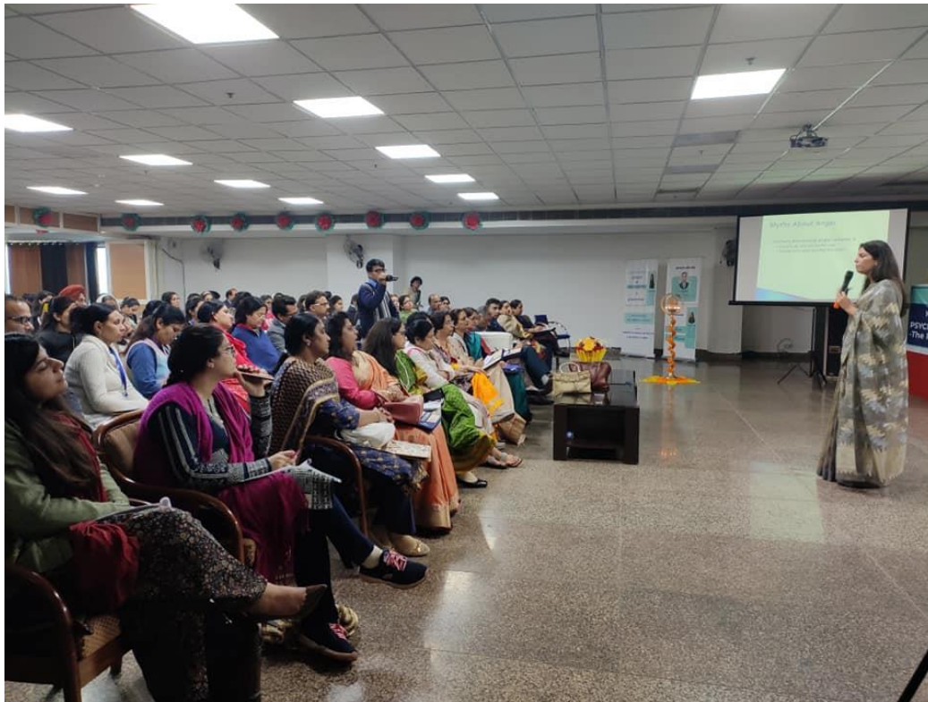
Workshop on Anger Management