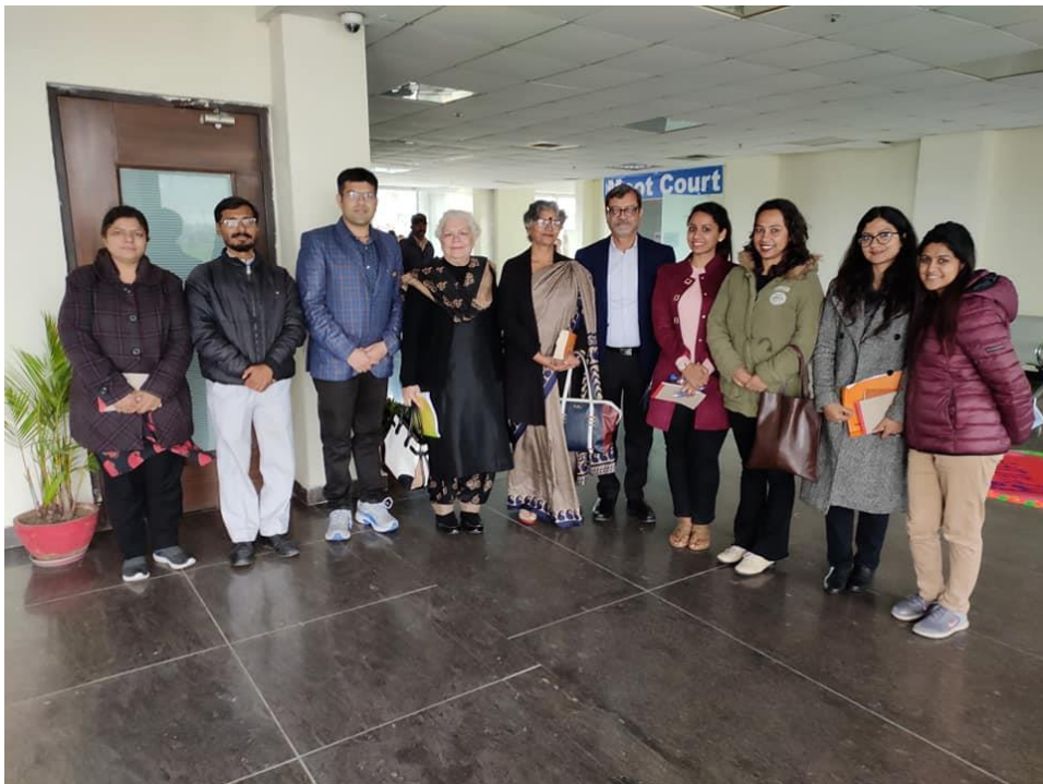
BoS Meeting 2020