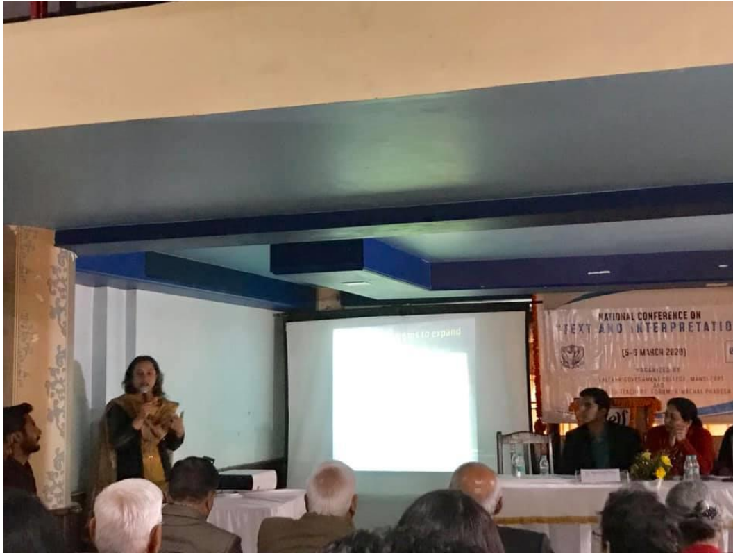
Vallabh Govt. College, Mandi