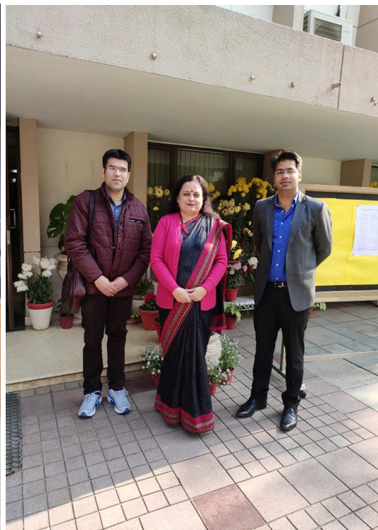
DAV School, Sector-14, Gurgaon