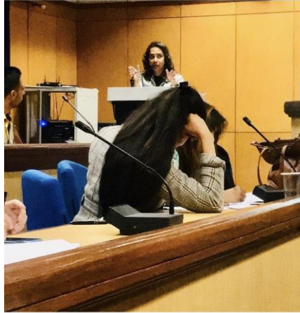
At Panjab University, Chandigarh