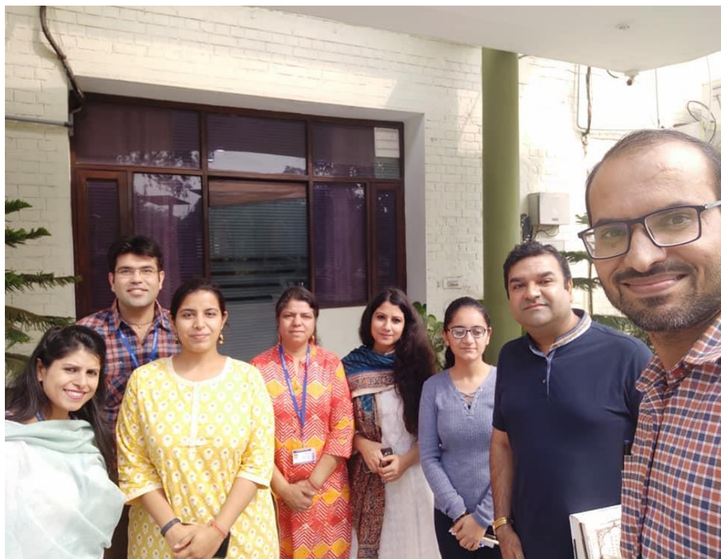
A Talk by Arundhati Roy