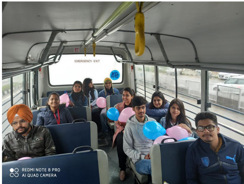
Visit to Guru Nanak Sewa Ashram