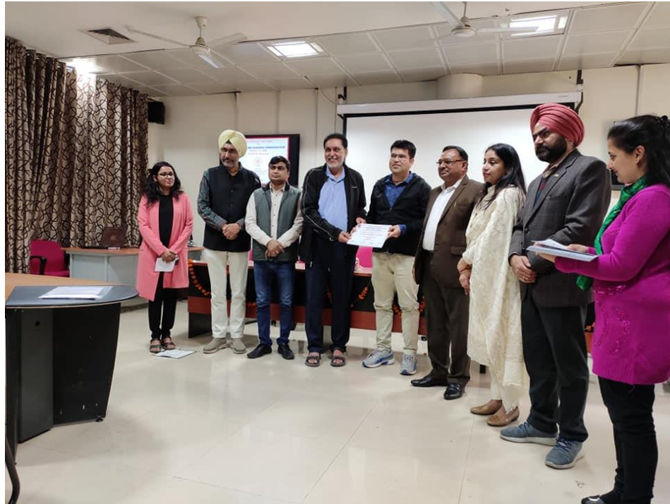
National Institute of Technology, Jalandhar