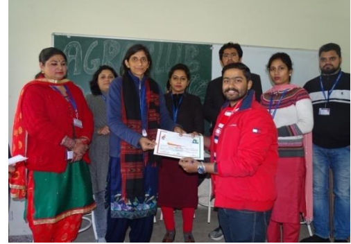
Prizes were distributed to the winners.